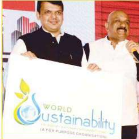
LAUNCH OF WORLD SUSTAINABILITY BY THE HONORABLE CHIEF MINISTER OF MAHARASHTRA DEVENDRA FADNAVIS ON 24/07/2015 AT TAJ LANDS END, MUMBAI.